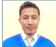
Avitso (Meritorious Award)