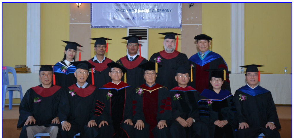
ITCS professors, Board Members, and instructors

Our contemporary time is deep dark, very chaotic, and very confusing in all areas. Among them, Cambodia stays in a dangerous spiritual state. We have to change the killing field into a living field, and establish the kingdom of God on the green field and on the abundant water by proclaiming sound teaching.