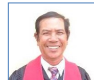
Uy, Sao Sat