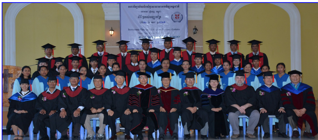
The graduates together with the professors, board members, and instructors of ITCS, Cambodia during the Fourth Commencement Ceremony on January 30, 2015.