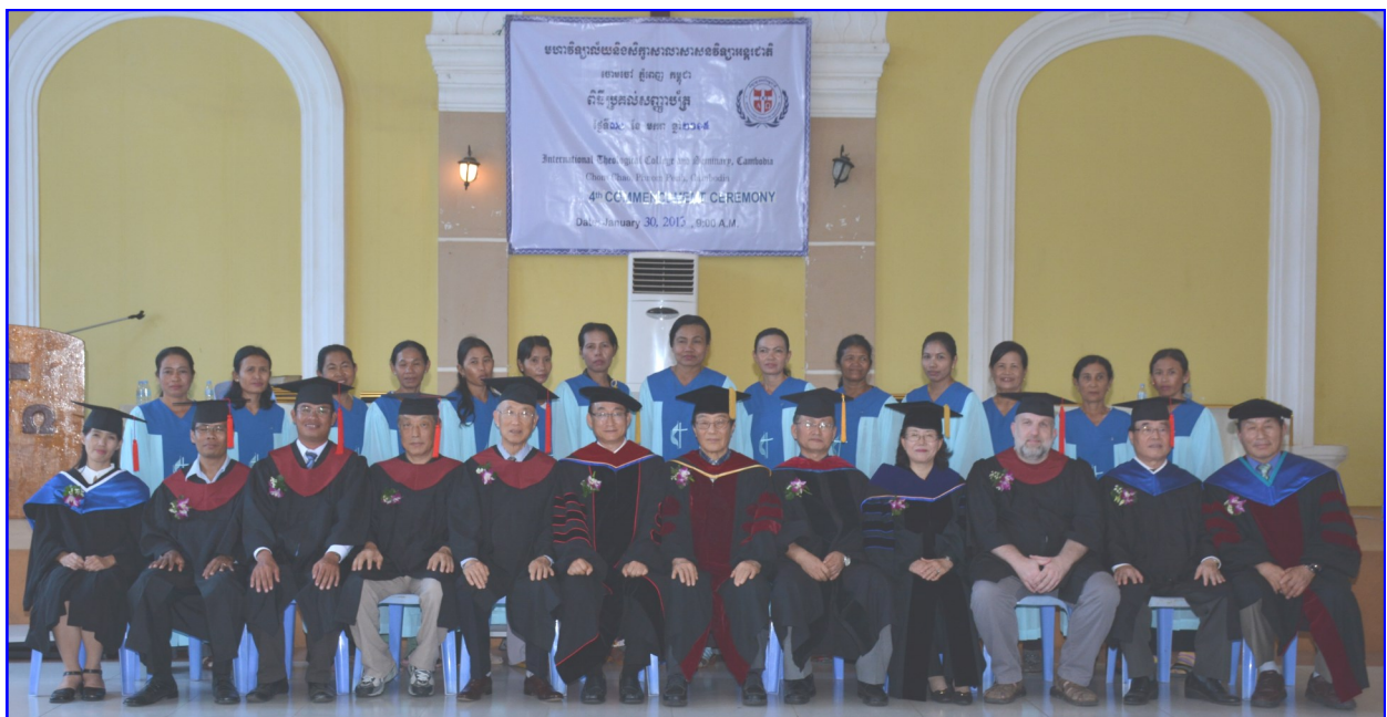
The first 14 graduates of Woman Leadership Education together with the ITCS professors, Board Members, and instructors